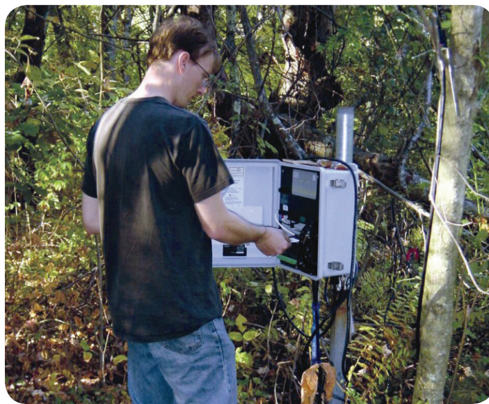
IPSWATCH field technician with a YSI 6200 DAS.

When the time came to select water quality monitoring technology for IPSWATCH, Vörösmarty, Wollheim, and colleagues contacted YSI Integrated Systems & Services. YSI Integrated Systems & Services provides end-user-configurable data acquisition systems and services for virtually any water quality, hydrological, and meteorological monitoring and response program. Wollheim selected YSI Multiparameter Sondes and the YSI 6200 Data Acquisition System (DAS).